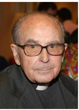
Mons. Sebastián Gayá Riera

Across the Americas it extends with great strength and vitality: large numbers of people and groups are mobilized; service structures are established; integration into diocesan pastoral activities and leavening of the environments resulted.